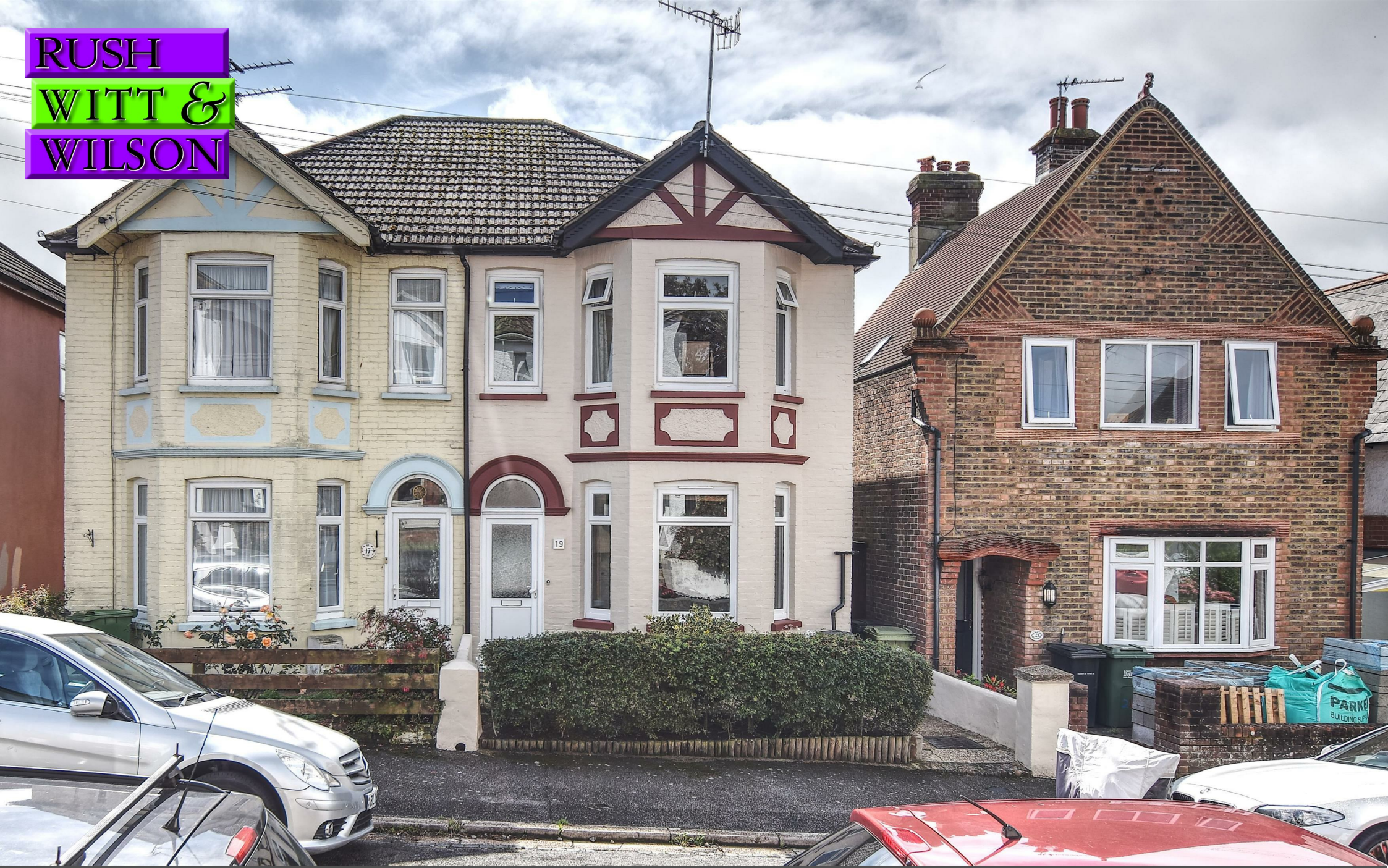
19 Cambridge Road, Bexhill-On-Sea, East Sussex TN40 2BU £312,000